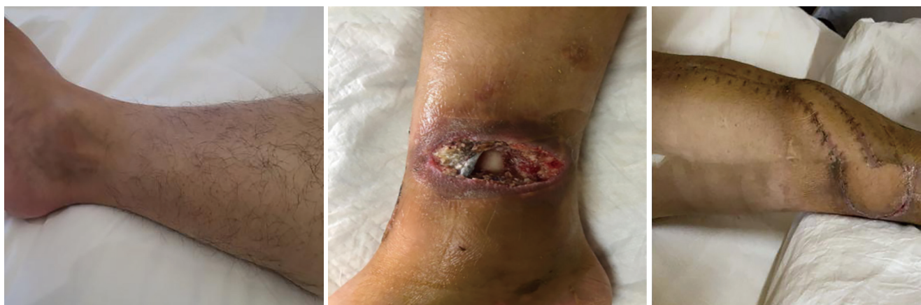
Figure 1 Patients with ankle fractures before treatment (left); the exposed state of steel plates (middle); after microsurgical repair and treatment (right).

stage. A markedly effective clinical efficacy status involves the following: the flap survives after the operation, the wound is significantly reduced, the soft tissue covers the exposed steel plate, the surface regrows fresh granulation tissue, and the wound heals smoothly after dressing change. An effective clinical efficacy status involves the following: there is postoperative necrosis of the partial flap with some steel plates still exposed, however, the exposed area is reduced, and the wound is healed following re-treatment. An ineffective clinical efficacy status refers to the flap being necrotic after the operation, and the exposed area of the steel plate does not decrease. The clinical effectiveness rate was calculated using the following equation: Clinical effectiveness rate = (cured + markedly effective + effective)/number of cases \times 100%.