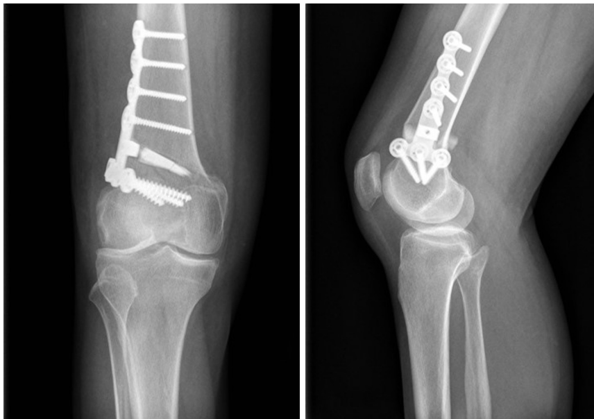
Figure 2 Post-operative X-rays (AP view on the left and lateral view on the right) of a lateral opening-wedge DFO stabilized using a Puddu Plate.

osteotomy healing (14). Figure 2 shows a post-operative x-ray of a lateral opening wedge osteotomy.