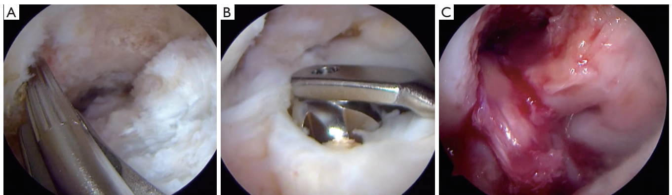
Figure 3 The primary steps for reconstruction of the anterior cruciate ligament (ACL) include preparation of the femoral footprint (A), drilling of the tibial tunnel (B), and ultimately the passing of the graft into the tunnels (C).