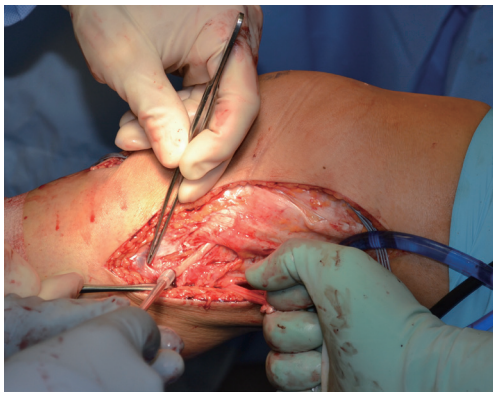
Figure 4 The fibular collateral ligament (FCL) is reconstructed by using a semitendinosus autograft when possible. The femoral attachment is secured prior to passing the graft underneath the superficial layer of the iliotibial band (IT band), and ultimately is fixed in the fibula with the knee flexed to 30° and in neutral rotation.

especially in the setting of knee hyperextension and varus force mechanisms of injury.