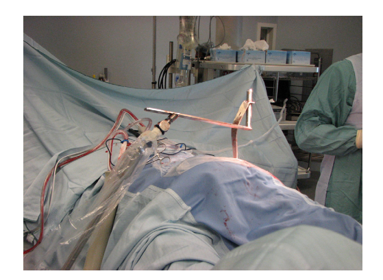
Figure 1 Spider retractor holding anterior hip retractor during anterior-Hueter hip resurfacing.