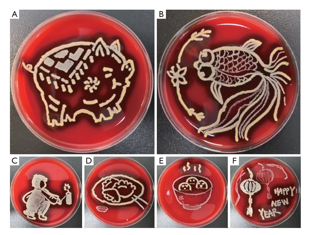
Figure 2 Characteristics of the Chinese New Year. (A) The year of pig; (B) koi which represents abundance; (C) setting off firecrackers; (D) boiled dumplings; (E) dumpling balls; (F) red lanterns with "Happy New Year" ( Staphylococcus aureus and Enterococcus faecalis in blood agar plate, 37 °C, 20 h).