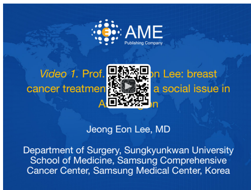
Figure 3 Prof. Jeong Eon Lee: breast cancer treatment remains a social issue in Asian region (1).

Available online: http://www.asvide.com/articles/1847