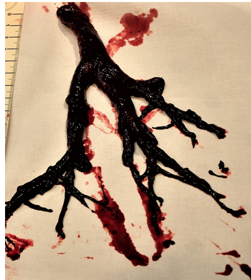
Figure 3 Detail of the mold clot involving the segmental and subsegmentary bronchial branches.

However, few cases of EBUS-TBNA related massive haemorrhage have been reported in literature. In a case