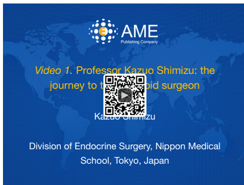
Figure 2 Professor Kazuo Shimizu: the journey to be a thyroid surgeon (1).

Available online: http://www.asvide.com/articles/1624