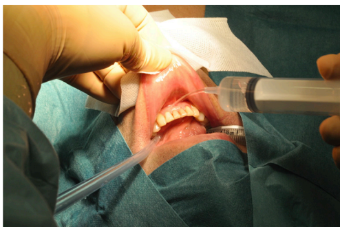
Figure 2 Disinfection of the oral cavity.