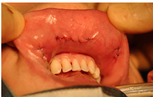
Figure 3 Outcome of the 3 vestibular incision.