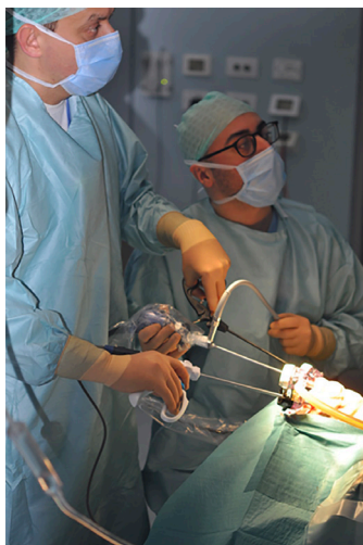
Figure 1 Operative room setting. The 1st assistant is important, he helps to hold correctly the camera. The first assistance is key person to help endoscopic surgery become a success and send at surgeon left.