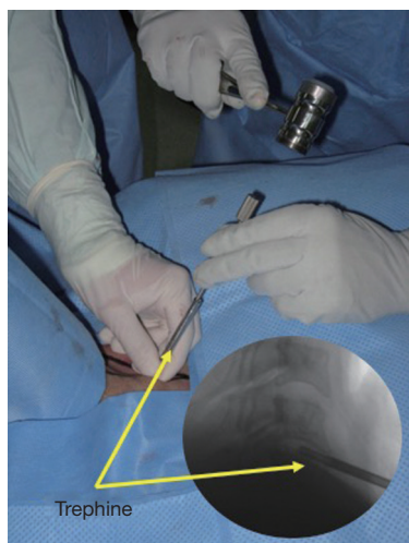
Figure 3 Annulotomy with trephine under fluoroscopic guidance.