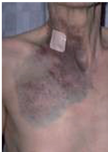
Figure 4 Cervical hematoma following ACED. ACED, anterior cervical endoscopic discectomy.

techniques such as the ACED offer significant advantages over ACDF. These include smaller incisions and less tissue trauma, the outpatient nature of the ACED surgery, and conceivably a lesser risk of postoperative adjacent segment disease with instability while providing excellent clinical outcomes. Therefore, the minimally invasive ACED surgery as an excellent option to treat radiating arm pain secondary to CR (3-5,9-15).