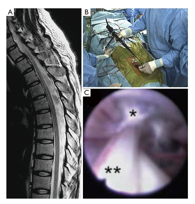
Figure 1 A case of spinal arachnoid cyst in a 3-year-old girl treated by a 2 mm flexible endoscope. (A) Preoperative T2-weighted MR image revealing an intradural arachnoid cyst extending from the C-7 to the L-3 vertebral level; (B) intraoperative pictures showing how we inserted an endoscope through a 2-levels hemilaminectomy; (C) an endoscopic view showing the caudal cyst wall (single asterisk) and the cauda equina (double asterisk). Figures were obtained and modified with permission (9).

surgical treatment often require large incisions. A better alternative is to use a flexible endoscope that can be inserted and advanced through a small opening, allowing a less invasive approach.