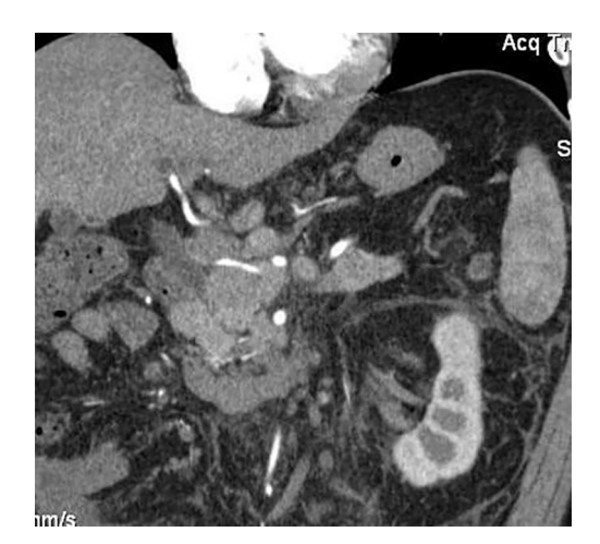
Figure 1 CT scan of abdomen showing extensive tumor burden at presentation. CT, computed tomography.

Journal of Gastrointestinal Oncology, Vol 10, No 5 October 2019