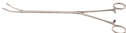
Figure 4 Snake clamp for uniportal procedures.

oncological), pleural metastasis, and definitive spontaneous pneumothorax and hemothorax by closed chest trauma or by postoperative complications in cardiac surgeries.