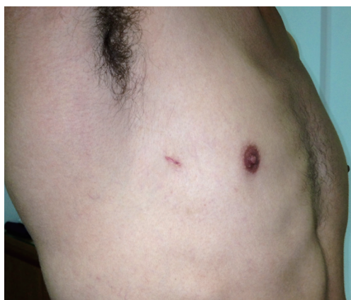
Figure 2 Final result of a uniportal sympathectomy.