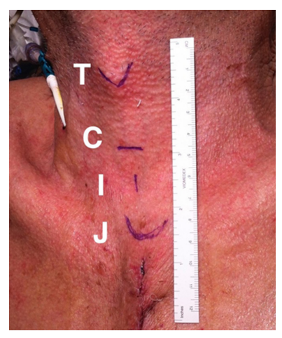
Figure 2 Markers drawn with a dermographic pen before surgery. T = thyroid cartilage; C = cricoid ring; I = incision; J = jugular fossa. Note the length of the incision.