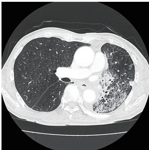
Figure 2 Computed tomography showing ground-glass opacity and thickening of the interlobular septum of the residual left lower lobe.

chemoradiotherapy (S-1: orally at 40 mg/m 2 twice a day on days 1 to 14 and 22 to 36 + Cisplatin: 60 mg/m 2 on days 1 and 22, radiation: 40 Gray/20 fractions beginning on day 1) was performed as described previously (4), and the mass was reduced in size by 33%, which was considered a partial response under the RESIST criteria ( Figure 1B ). We then performed left upper sleeve lobectomy under the patient's very carefully informed consent. The plasma D-dimer level before the operation was <0.5 µg/mL. During the operation, we performed LUL with plasty of the bronchus and pulmonary artery under proper systemic heparinization by