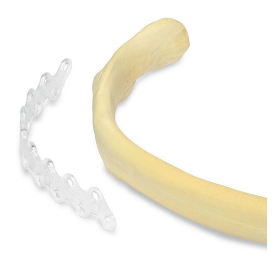
Figure 5 An absorbable plate adaptable for rib fixation (43).

are malleable, and can be combined to provide additional length or rigidity ( Figure 5 ). When used as indicated by the manufacturer, these plates are a bit less rigid, and allow for a bit more movement at the fracture site; as such, they may be poorly suited for reconstruction at areas of high load stress (44). However, the lack of complete rigidity at the fracture site may be advantageous through the concept of "stress shielding", which postulates that some load stress is needed at the fracture to stimulate optimal bone regrowth. This load stress is often missing in completely rigid fixation associated with plate stabilization, but present to some degree with bioabsorbable or intramedullary splint repairs (45).