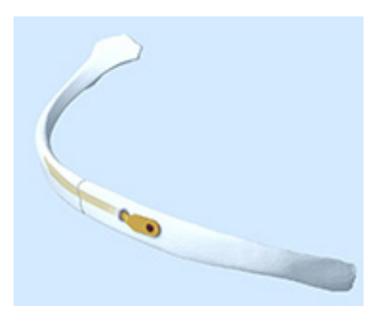
Figure 4 An example of an intramedullary strut, or splint, with single point fixation (41).

are malleable, and can be combined to provide additional length or rigidity ( Figure 5 ). When used as indicated by the manufacturer, these plates are a bit less rigid, and allow for a bit more movement at the fracture site; as such, they may be poorly suited for reconstruction at areas of high load stress (44). However, the lack of complete rigidity at the fracture site may be advantageous through the concept of "stress shielding", which postulates that some load stress is needed at the fracture to stimulate optimal bone regrowth. This load stress is often missing in completely rigid fixation associated with plate stabilization, but present to some degree with bioabsorbable or intramedullary splint repairs (45).