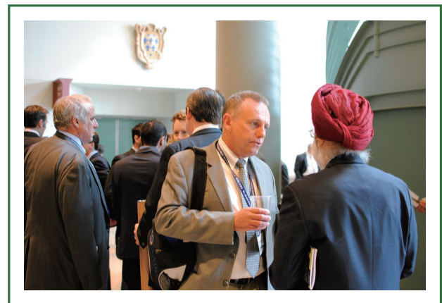
Figure 1. Communication between attendees during tea break.