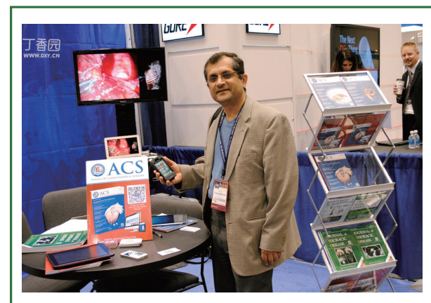
Figure 6. Congratulations! The App was installed successfully.

are planning, similar operations as a potential source of support, saying that nowadays cardiac physicians tell their patients “No matter what you’ve got, Cheney’s had it.”