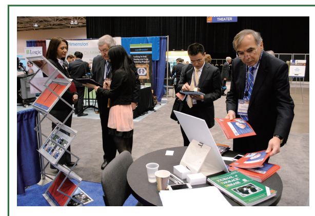
Figure 7. The editorial staff was introducing the journal and help experts to sign up for update journal content.