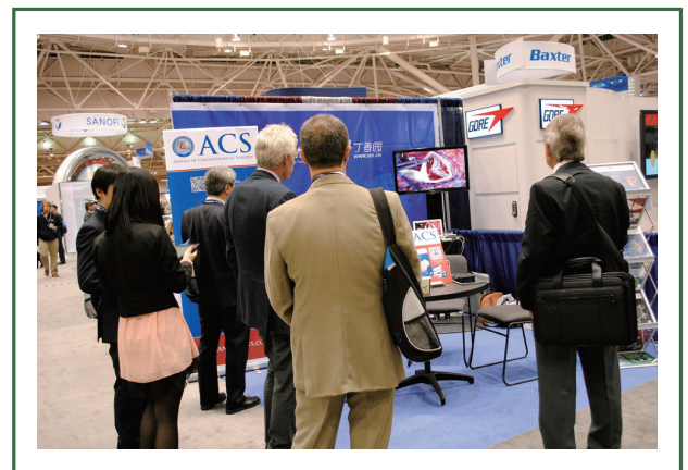
Figure 11. Experts were enjoying the videos displayed at our booth.