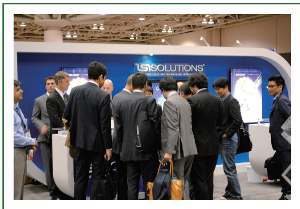
Figure 3. Experts gathered to enjoy the demonstration of the exhibitor.