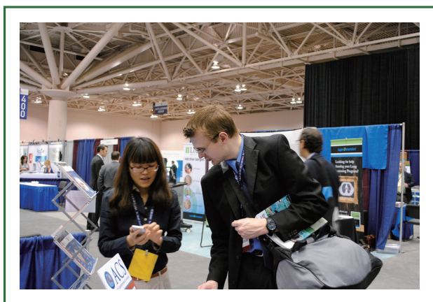
Figure 4. Our editorial staff introduced the App to our visitor.