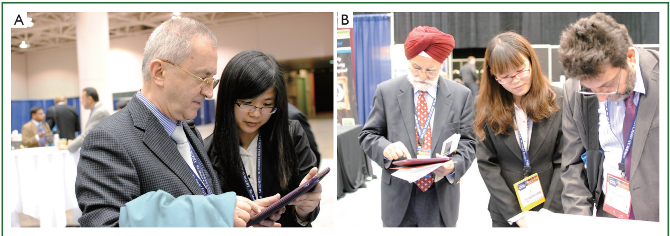
Figure 8. A. The expert was signing up for update journal content; B. The experts were getting to know the journals.