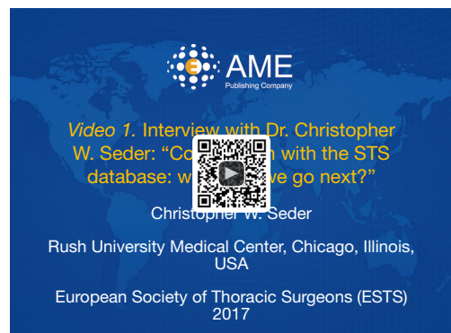
Figure 2 Interview with Dr. Christopher W. Seder: “Cooperation with the STS database: where do we go next?” (1).

Available online: http://www.asvide.com/articles/1744