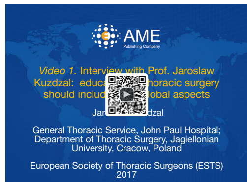
Figure 2 Interview with Prof. Jaroslaw Kuzdzal: education on thoracic surgery should include more global aspects (1).

Available online: http://www.asvide.com/articles/1745