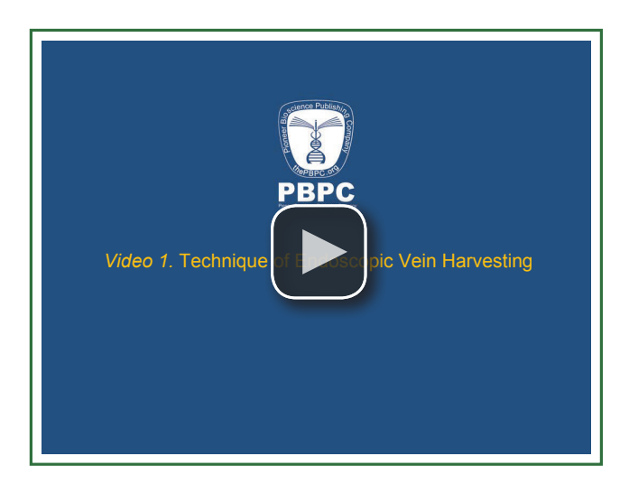
Video 1. Technique of endoscopic vein harvesting.