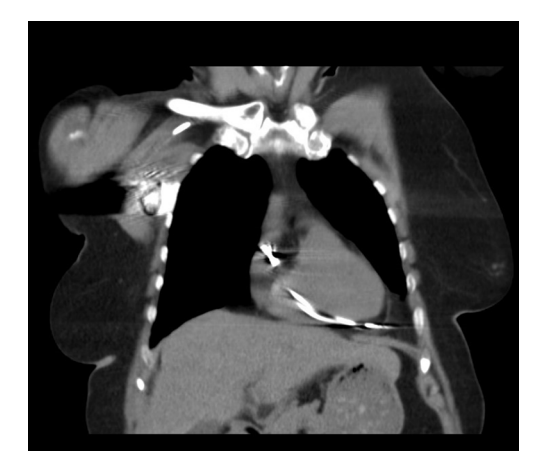
Figure 2 Right ventricular perforation by pacemaker lead to left lateral side. CT imaging without contrast agent.