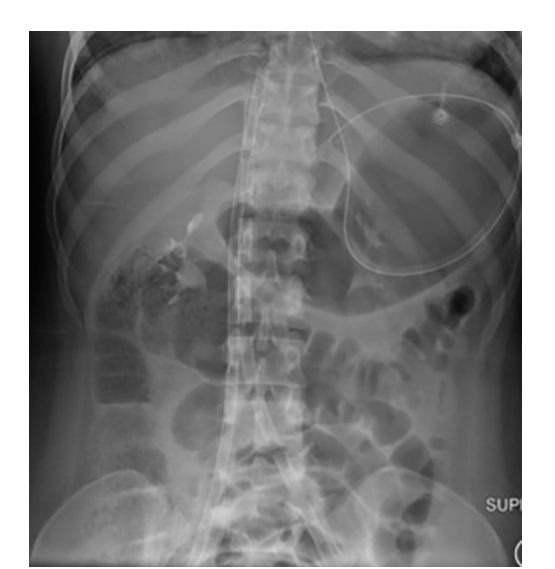
Figure 2 Abdominal X-ray showing the longer course of the leftsided femoral cannula.

cannula capable of being passed. For example: