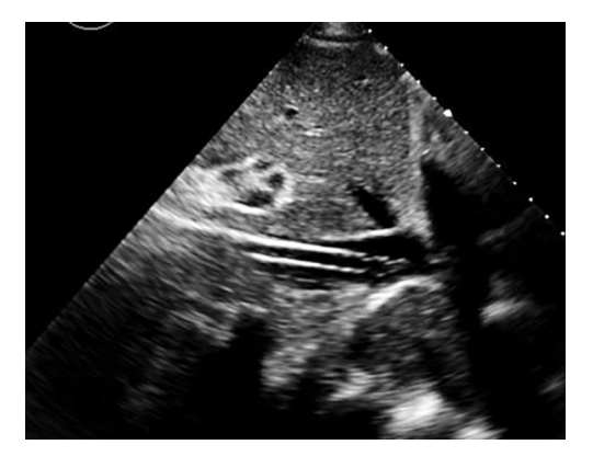
Figure 4 Ultrasound-guided positioning of the return cannula in the IVC. IVC, inferior venous cava.

of the heart. We also intermittently check the position of the wires throughout the procedure to confirm there has been no wire migration. In difficult cases, such as tortuous vessel or repeated kinking of the wire, we may employ stiffer wires (such as an Amplatz Super Stiff<sup>TM</sup> Guidewire, Boston Scientific, USA). However, this requires careful monitoring to ensure the wires do not migrate inwards as the risks of internal damage are higher with a stiffer, straight tipped wire.