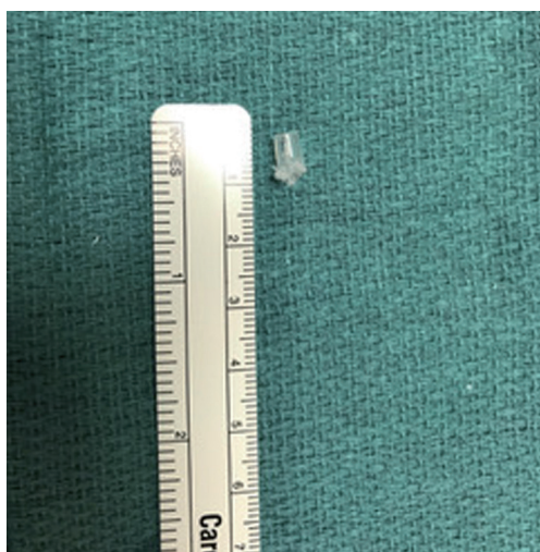
Figure 2 Plastic tip of the syringe after removal from the ETT. ETT, endotracheal tube.

tolerance. The airway exam revealed a Mallampati class 3 airway. Prior to anesthesia induction, a left radial arterial line was placed in anticipation of a prolonged case and potential significant blood loss. An arterial blood gas obtained on room air prior to induction revealed a pH of 7.43, p\text{CO}_2 39 mmHg, p\text{O}_2 65 mmHg and an \text{O}_2 saturation of 96.9%. General anesthesia was induced with propofol and succinylcholine. The intubation was guided by video laryngoscopy using a glide scope and the ETT was secured at 21 cm at the lips. The patient was placed on a volume-controlled ventilator cycle with tidal volume 550 mL, rate 14, PEEP +8 mmHg with a peak airway pressure of 29 mmHg. The end tidal \text{CO}_2 was 39 mmHg. Anesthesia was maintained with Sevoflurane, muscle relaxation and fentanyl boluses for analgesia.