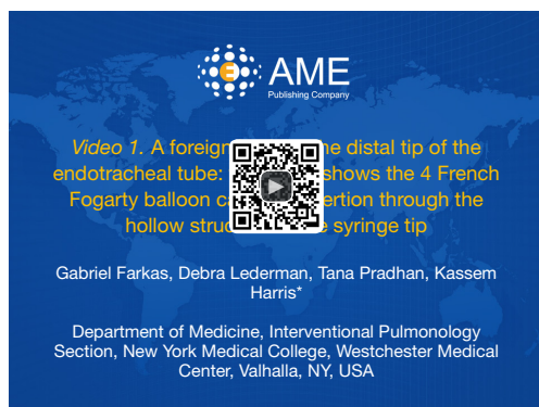
Figure 4 A foreign body at the distal tip of the endotracheal tube: this video shows the 4 French Fogarty balloon catheter insertion through the hollow structure of the syringe tip (5). Inflation of the balloon locked the foreign body in and allowed its retrieval. Available online: http://www.asvide.com/article/view/25001

there are no standardized methods for administering aerosolized albuterol through an ETT in the operating room. Multiple methods have been described to administer the inhaled bronchodilators through the ETT (9,10). One method is to use an MDI in the barrel of a 60 mL syringe with the plunger being used to activate the device. Another method suggests attaching a 15 cm length of tubing to the Luer-lock of the syringe to facilitate administering the aerosolized albuterol as distally as possible down the ETT. Many clinicians attach the 60 mL syringe containing