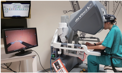
Figure 1 Robotic simulator.