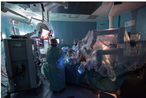
Figure 3 Operatory theatre.

as “observational centres” and they represent a reference point for the whole trainee community to obtain robotic tips and tricks. An important aspect of the learning process is the acquisition of a “standardization of technique” which allows to reduce the learning curve time and consequently the operative time and the number of adverse events (e.g., bleeding and prolonged air leak).