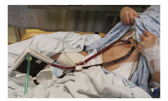
Figure 3 Pumpless PA to LA novalung for right ventricular unloading and oxygenation in pulmonary hypertension with decompensated right heart failure.

practice are described in case reports, small case series and reviews. In some centers lung transplantation is performed by general thoracic surgeons, and only in this patient population are larger case series documented, with long term outcome data available.