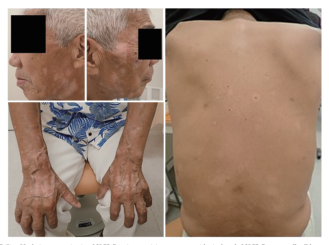
Figure 1 Vitiligo-like lesions occurring in a NSCLC patient receiving treatment with nivolumab. NSCLC, non-small cell lung cancer.

depigmentation by the loss of melanocytes, and has long been suspected to be an autoimmune disease (4). The onset of vitiligo can be triggered by many factors such as sunburn, mechanical trauma and chemical exposures to the melanocytes; the triggers are all thought to induce oxidative stress, which increase melanocyte targeting by promoting antigen presentation, resulting progressive development of white macules on the skin. However, the trigger is unclear in most cases (4,5). Vitiligo-like lesions are sometimes observed in melanoma patients receiving anti-PD-1 therapies, and considered to be ascribed to cross-reaction of anti-melanoma immunity to normal melanocyte antigens. In melanoma patients, vitiligo-like depigmentation has onset between 2 and 15 (median, 4-5) months from the start of anti-PD-1 therapy, and is generally associated with favorable clinical outcomes (6,7). Vitiligo is not life-threatening, but has been shown to exert a harmful influence on the quality of life. A recent meta-analysis showed the patients with vitiligo were significantly more prone to suffer from depression (8).