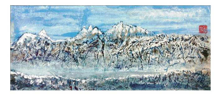
Figure 8 Selected Dr. Yim's artwork "Blue Mountain (IV)" (size: 76 \text{ cm} \times 33 \text{ cm} ).