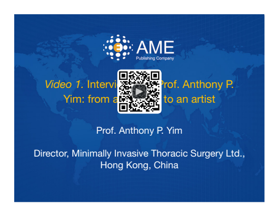
Figure 6 Interview with Prof. Anthony P. Yim: from a surgeon to an artist (1).

Available online: http://www.asvide.com/article/view/25568