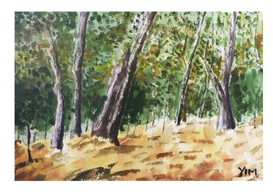
Figure 10 Selected Dr. Yim's artwork "Forest" (size: 27 \text{ cm} \times 18 \text{ cm} ).

AME Publishing Company, for the editorial support.