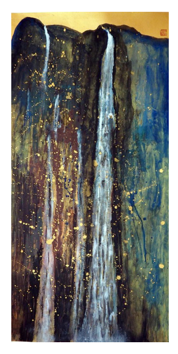
Figure 7 Selected Dr. Yim's artwork "Waterfall (IV)" (size: 69.5 \text{ cm} \times 138.5 \text{ cm} ).