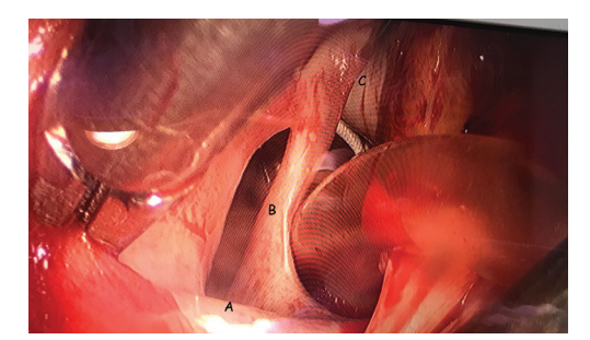
Figure 1 Intraoperative image showing: A, right superior pulmonary vein; B, muscular band; C, interatrial septum.

Journal of Thoracic Disease, Vol 10, No 7 July 2018