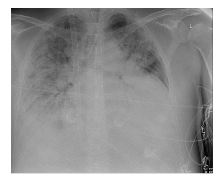
Figure 1 Plain chest radiograph shows consolidations in both lungs with atelectasis on the left basal side. The endotracheal tube is situated just above the carina. Bicaval cannula for extracorporeal support in right internal jugular vein with the tip in de inferior caval vein.

High dose pulse therapy methylprednisolone was started and 1 week later ECLS treatment could be terminated and patient underwent a thymoma resection. After weaning from mechanical ventilation patient was dismissed from the ICU within two weeks of surgery. He was treated with cyclophosphamide, cyclosporine and prednisolone to control his immune dysregulation. Unfortunately, 50 days after ICU discharge, but still on the ward, he had an intraparenchymal frontal bleeding. Further treatment was considered futile and the patient died.