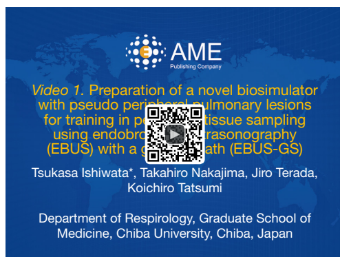
Figure 2 Preparation of a novel biosimulator with pseudo peripheral pulmonary lesions for training in peripheral tissue sampling using endobronchial ultrasonography (EBUS) with a guide sheath (EBUS-GS) (9).

Available online: http://www.asvide.com/watch/32997