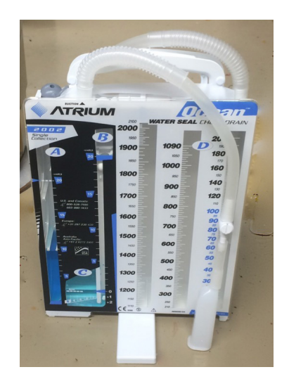
Figure 1 The analog drainage system Ocean Atrium (Maquet, Germany): a classical wet-seal drainage system with an analog scale to measure the total amount of fluid, a surge chamber and external vacuum-suction.