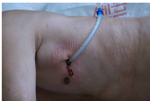
Figure 2 The incision for uniportal VATS LUL lobectomy. VATS, video-assisted thoracoscopic surgery; LUL, left upper lobe.