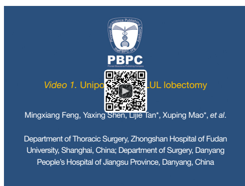
Figure 5 Uniportal VATS LUL lobectomy (9).

Available online: http://www.asvide.com/articles/393