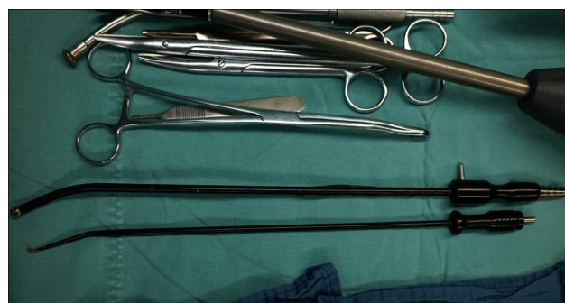
Figure 3 The designed surgical instruments for uniportal VATS. VATS, video-assisted thoracoscopic surgery.