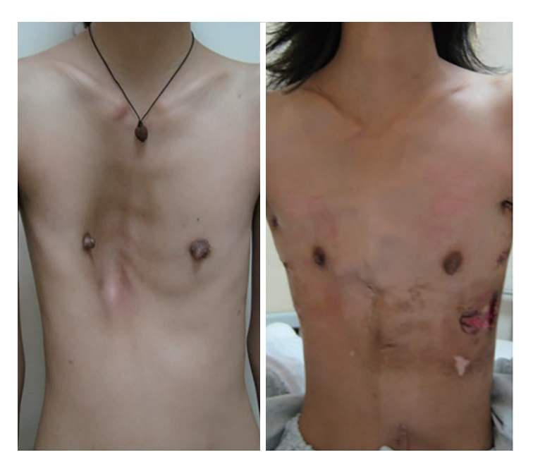
Figure 3 A patient 21-yr-old with 3 bars, experienced incision site infection and healed after bar removal, was grateful for the Nuss procedure for bringing her a marriage and family after the operation (the left panel was collected before the operation, and the right panel was collected after bar removal).

pneumothorax in the postoperative 1–6 months and were cured with closed drainage of the pleural cavity. The steel bars were generally removed after they were retained in the body for 36 months; approximately 51.6% (79/153) of the patients have had the steel bars removed. Seven cases (4.6%) experienced the exposure of a steel bar caused by poor healing of the incision. Two of these cases (1.3%) underwent early removal of the steel bars within 2 years postoperation, whereas the other 5 cases received routine dressing changes for 2 years and then underwent removal of the steel bars. One case experienced serious displacement of a steel bar; the displaced steel bars were removed 2 months