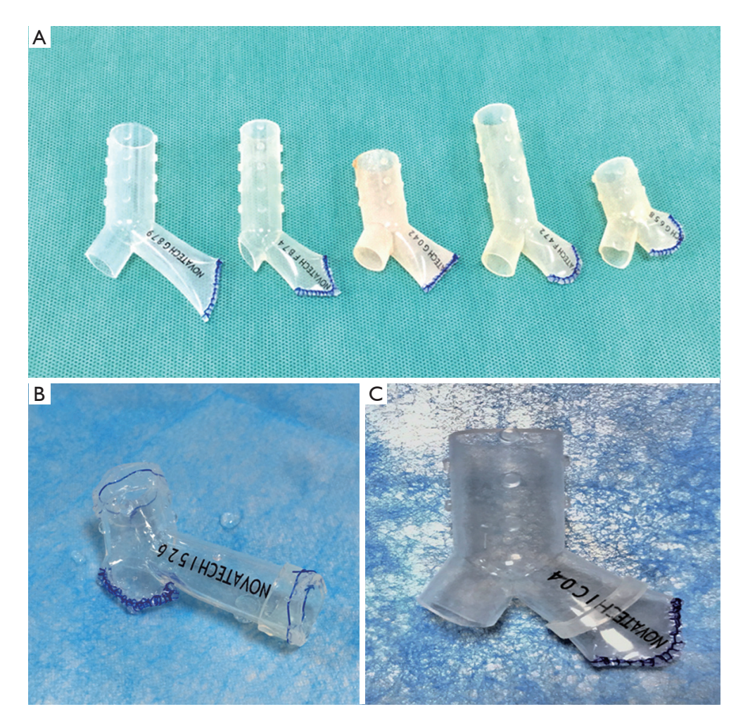
Figure 1 Illustration of the modified silicone stent. (A) The modified silicone stent consisted of the main branch, the lateral branch, the occluded branch; (B) the suitable stent rings were sutured to the main branch and the lateral branch of Silicone stent; (C) the stent ring was sutured to the occluded branch.

precaution of active bleeding during operation, including local instillation of hemostatic medications, balloon tamponade, intubation supplies with endotracheal tubes with larger sizes. In unstable group, these measures were initially performed to maintain airway stabilization before stent placement. The flexible bronchoscopy was performed before stent placement to identify the site of bleeding. Furthermore, the length and the inner diameter of airway lesion were measured for selection of the appropriate stent when becoming stable. To further confirm the luminal diameter of the target bronchus, the sterilized straight stent segments with different outer diameters were used under rigid bronchoscopy to detect the optimal size of the stent.