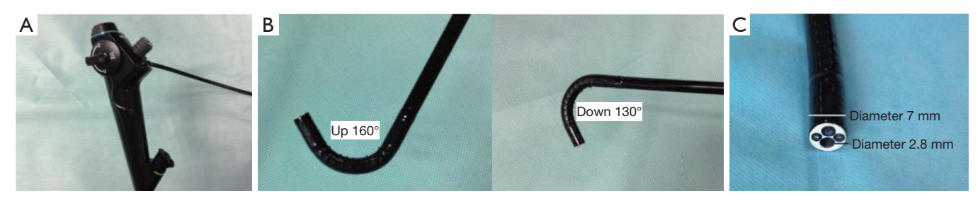
Figure 1 The parameters of thoracoscope. (A) Semi-rigid thoracoscope (Olympus); the operating part is the same as the flexible bronchoscope. (B) Angled range: up 160/down 130. (C) Insertion section of the thoracoscope with an outer diameter of 7 mm and a working channel with a 2.8-mm diameter.

LTF-240) produced by Olympus Corporation of Japan. This semi-rigid medical thoracoscope is similar to a standard electronic bronchoscope and consists of an operating handle and an operating lever. The lever has an outer diameter of 7 mm and a length of 27 cm, which consists of two parts, a 22 cm long proximal hard section and a 5 cm long flexible front end. The handle has a switch to control the movement of the flexible front end, making it capable of two-way angle conversion (upward rotation of 160 degrees, down 130 degrees). There is also a 2.8-mm diameter working hole on the operating rod, which can be used to insert biopsy forceps, needle biopsy, and other attachments and is compatible with electrosurgery and laser operation. The device achieves a single-point puncture technique with the aid of a disposable plastic flexible puncture sheath (8 mm I.D.). The new model 240 mode of operation allows for autoclaving to avoid cross-infection with pathogens. Compared with rigid thoracoscopic, semirigid medical thoracoscopy also has a distinct advantage, it is compatible with Olympus's compatible bronchoscope or gastrointestinal mirror operator and light source, so it will not bring additional costs, see Figure 1.