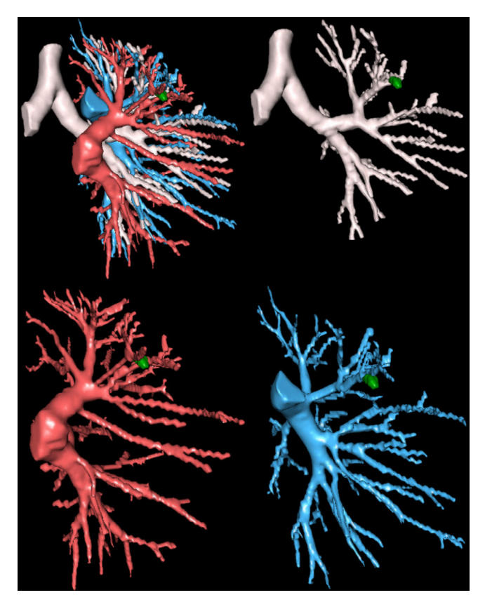
Figure 1 3D reconstruction using visible patients of a nodule of S3.