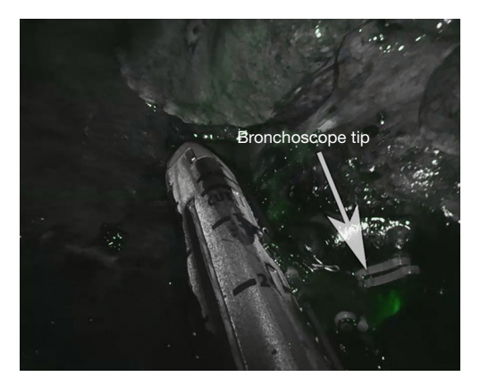
Figure 2 The bronchoscope is visible inside the target segmental branch using the camera in the firefly mode.