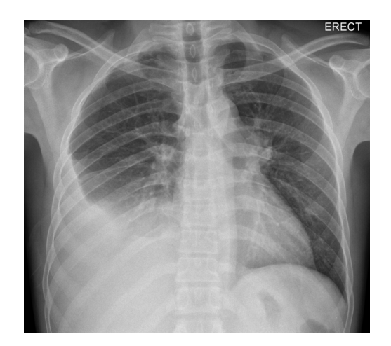
Figure 2 This chest radiograph was obtained from a patient with confirmed pleural TB. No significant parenchymal changes could be observed. TB, tuberculosis.