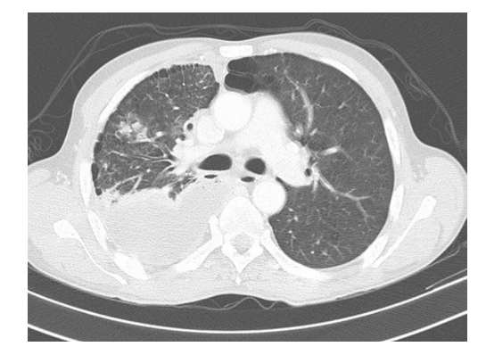
Figure 3 A CT from a patient with confirmed TB pleural effusion with parenchymal involvement (sub-segmental consolidation in this particular case). CT, computed tomography; TB, tuberculosis.

The coexistence of parenchymal disease in association with pleural effusion has been observed on chest radiograph