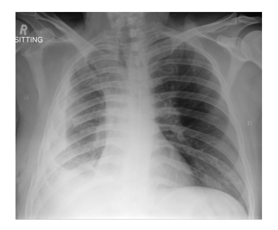
Figure 1 This chest radiograph demonstrates a severe case of fibrothorax as a long-term complication of TB pleuritis. TB, tuberculosis.