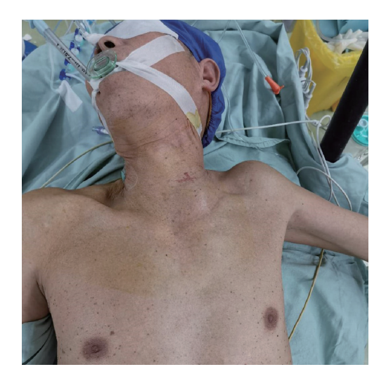
Figure 2 The head was rotated 30°–45° away from the tumor. adjacent structural involvement.

Figure 1 Chest CT showing the malignant tumors had invaded surrounding structures. CT, computed tomography.