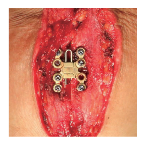
Figure 4 The upper sternum was fixed with a butterfly plate.

prevented with bone wax. The upper sternum was opened with a small sternum opener (Finochietto 70 mm) to enable adequate exposure of the tumor. Special attention was given to the separation and protection of intramammary artery. When necessary, ligation of the intramammary artery was performed. The thoracic duct was identified, isolated, tied, and ligated. The critical vessels such as the nameless artery, subclavian artery, and superior vena cava were dissociated respectively and controlled distally.