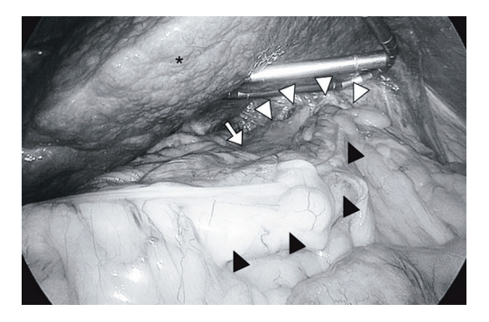
Figure 2 Esophageal hiatus (white arrow head) was enlarged and transverse colon (black arrow head) was herniated into left thorax along with gastric conduit (white arrow). *, lateral segment of liver.

covered by smooth membranous tissues like peritoneum or pleura. Interestingly, the sutures used for the fixation of reconstruction organs at the diaphragm were often observed on the graft or diaphragm, but the knots did not become loosened during repair surgery.