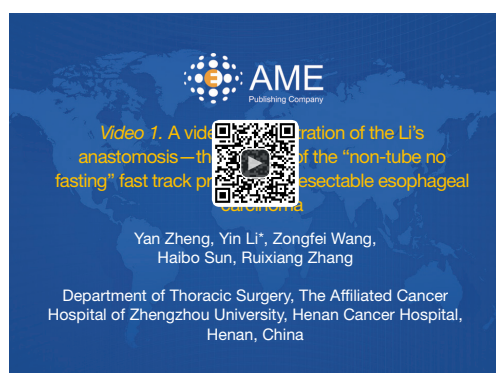
Figure 1 A video demonstration of the Li's anastomosis—the key part of the “non-tube no fasting” fast track program for resectable esophageal carcinoma (8).

POD, postoperative day; ESCC, esophageal squamous cell carcinoma; RCT, randomize controlled trials; NA, not available.