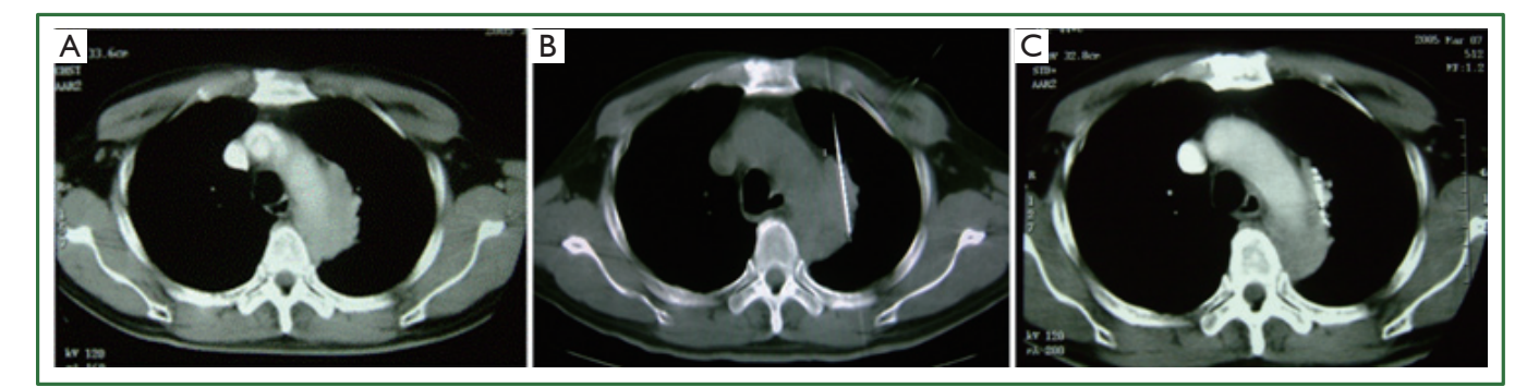
Figure 1. Non-small cell lung cancer of left hilus, underwent percutaneous cryosurgery and Iodine-125 seed implantation under CT guidance. A. Before treatment, CT showed a tumor close to aorta; B. Percutaneous cryosurgery was doing; C. Iodine-125 seeds had been implanted.