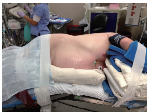
Figure 2 Anterior view of lateral decubitus positioning.