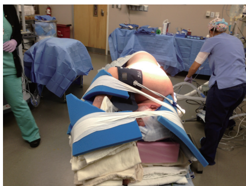
Figure 1 Lateral decubitus patient positioning.