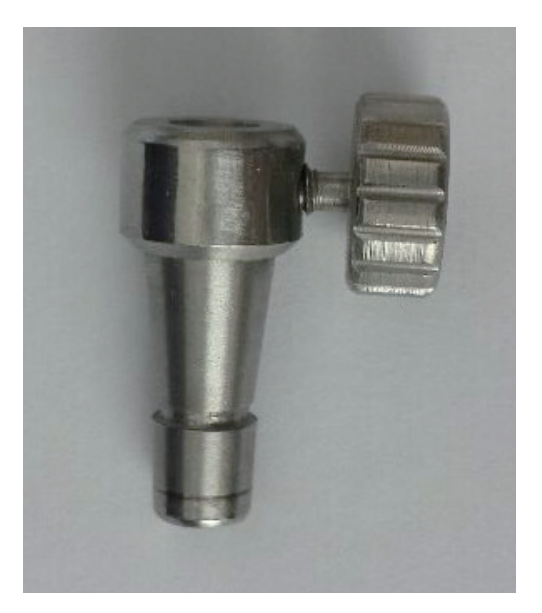
Figure 1 Device used to fix and stabilize a conventional TBNA needle to the EBUS scope. EBUS-TBNA, endobronchial ultrasound transbronchial needle aspiration.

The performance of TBNA with or without EBUS are essentially the same, passing a needle through the airway wall, however factors above and beyond real time US-guidance that may make EBUS-TBNA more effective are the 35 degree of angle at the exit of the needle from the working channel of the bronchoscope and the stiffness of the EBUS needle. These factors have eliminated the difficulty of obtaining an adequate angle of entry and the consequent need for a more flexible needle in cTBNA.