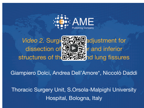
Figure 4 Surgical table adjustment for dissection of the upper and inferior structures of the chest and lung fissures (5).

Available online: http://www.asvide.com/articles/738