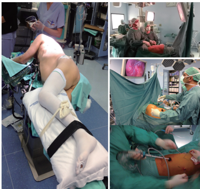
Figure 1 The position of the patient on the surgical table.