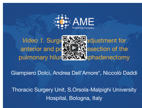
Figure 3 Surgical table adjustment for anterior and posterior dissection of the pulmonary hilum and lymphadenectomy (4).

Surgery was performed through three ports. We always use a 30° 10 mm video-camera. The first port “4-cm utility port” was made on the 4 th intercostal space between the latissimus-dorsi and the anterior-axillary line, the second