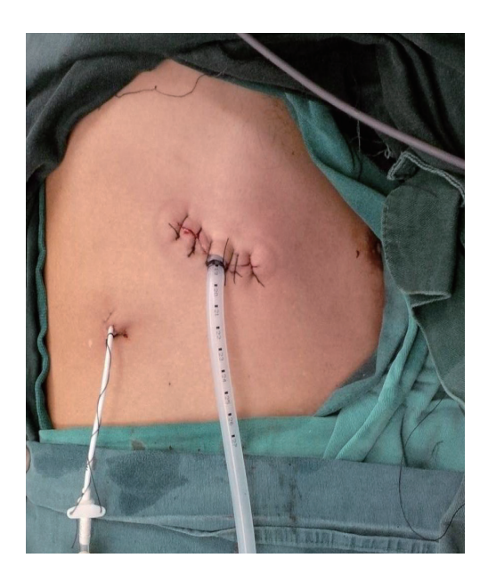
Figure 2 The position of the Abel drainage tube and chest tube.

single-incision thoracoscopic surgery, conversion to multiple-incision thoracoscopic surgery or thoracotomy was performed. A protective bag was always used to prevent tumor implantation in the incision when the lung specimen was being withdrawn from the single port.