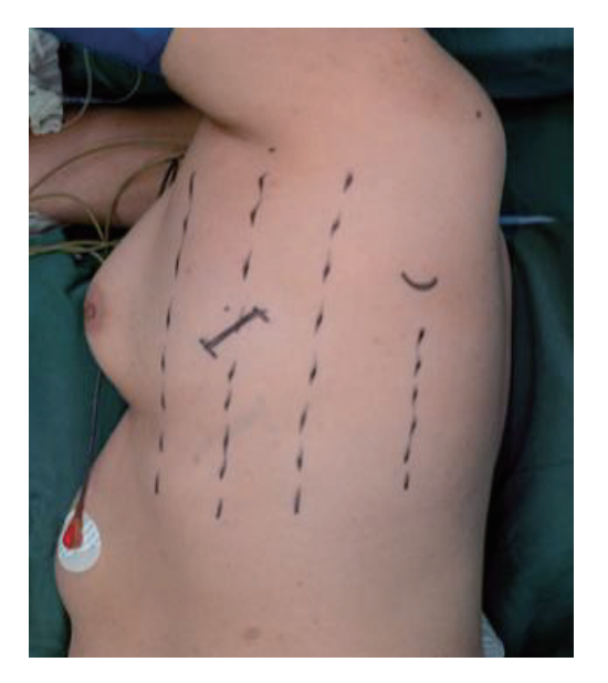
Figure 1 Lateral decubitus position and incision of the uniportal thoracoscopic segmentectomy.

Journal of Thoracic Disease, Vol 8, Suppl 3 March 2016