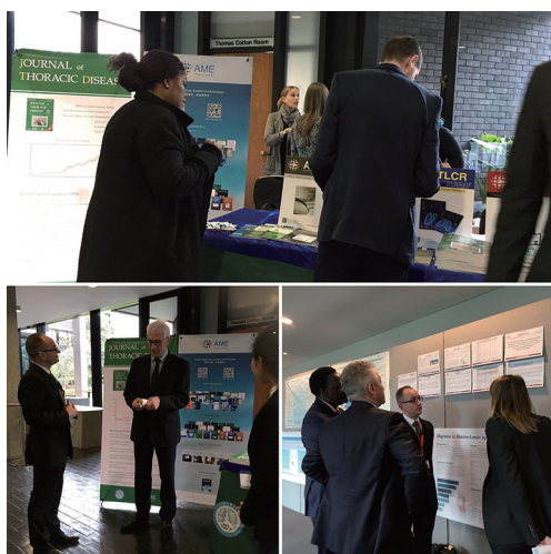
Figure 3 At the exhibition booth, Journal of Thoracic Disease ( JTD ) special issue was disseminated to every delegate on the conference day.

Hopefully, these studies will produce significant impact on public health in the future, and more interesting findings remain to be explored in the young discipline of sleep medicine ( Figure 5 ).