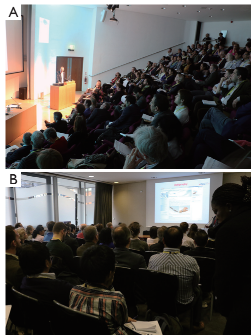
Figure 1 The International Conference: Clinical Update Sleep 2016. (A) Conference site 1: Seligman Room; (B) conference site 2: Sloane Room, Royal College of Physicians, London, UK.

In the Hot Topics and Clinical Trials session, the most notable trial was the SERVE HF study led by Professor Helmut Teschler. Outcomes of the SERVE HF study were published in New England Journal of Medicine in 2015 (1),