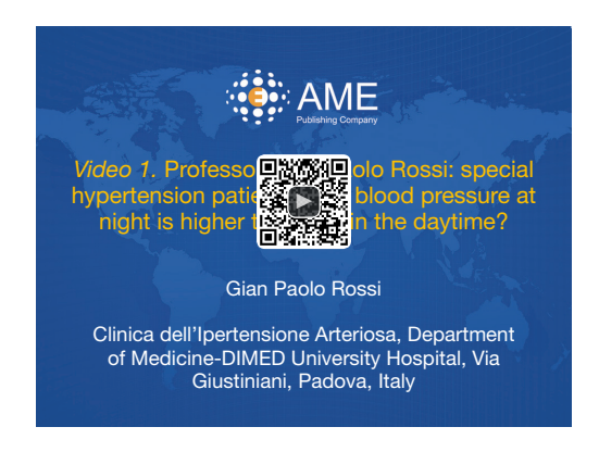
Figure 2 Hypertension and sleep apnea (1). Available online: http://www.asvide.com/articles/1024

between hypertension and sleep disorder?