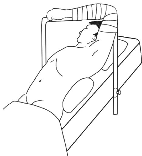
Figure 1 Surgical positions in splenectomy and hepatectomy. For splenectomy, the left side of the body was positioned higher than the right side by 30°, and the head was placed higher than the feet by 15°. For hepatectomy, the right side of the body was placed higher than the left side by 30°, while the head was positioned higher than the feet by 15° (by adjusting the surgical bed).