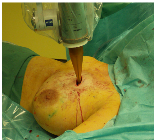
Figure 1 Intraoperative photograph showing an intrabeam applicator being placed into a tumour bed.

Society (ABS), have provided recommendations aimed at patient selection for APBI (5-7). Detailed guidelines concerning the appropriate target definition and quality assurance are also available, especially for MIB APBI technique (25,26). Likewise, long-term outcomes are well documented for MIB (21,22), but less so for other APBI techniques. Finally, the long-term risk of secondary cancer is reduced 2- to 4-fold in MIB with the lowest mean lung dose, compared to other APBI techniques (27).