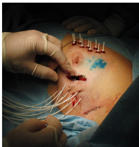
Figure 4 Perioperative open-cavity multi-catheter interstitial implantation. University Hospital in Hradec Kralove, Czech Republic.

It is also possible to use the implant for the interstitial cavity boost, with consequent WBI.