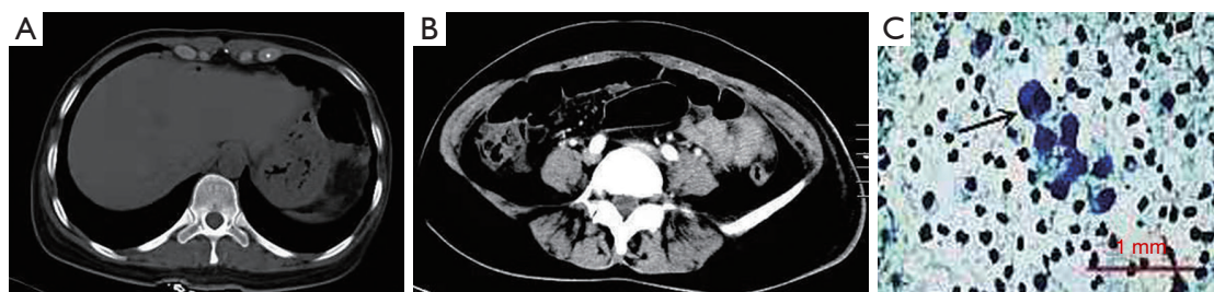
Figure 1 Contrast-enhanced computed tomography scan of the abdomen of a 43-year-old woman with a two-day history of worsening abdominal pain, showing (A) free intraperitoneal gas (arrow), and (B) a gas-liquid mixed density mass localized between the small intestine and sigmoid colon (arrow head). No solid intraluminal mass is present. (C) Exfoliative cytology of the peritoneal fluid obtained via abdominocentesis revealing atypical tumor cells.